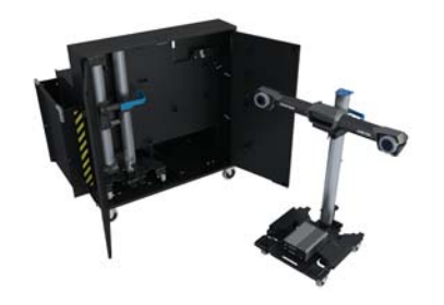
LOCKER ENABLING TWIN DOCKING OF THE C-TRACK SHOP-FLOOR STAND